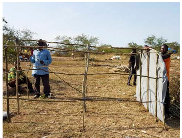
A Congolese new arrival builds a shelter for his family in Marembo C, in Uganda's Kyanwali