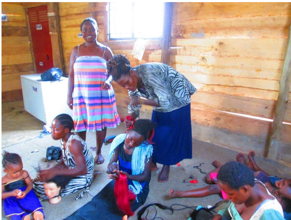
Buwate Sports Academy hairdressing class in the building newly constructed by RMF