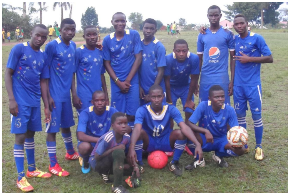
Buwate's under 17 team, after the first half of their game with Vega Light Sports Academy