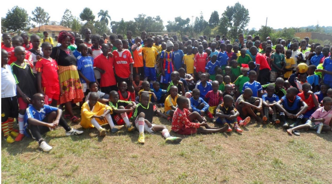
Group photo with all participating teams