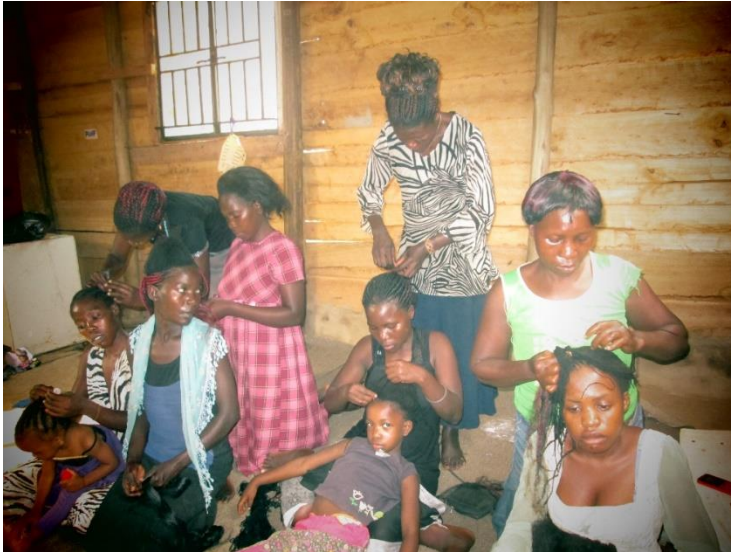
Hairdressing lessons in progress