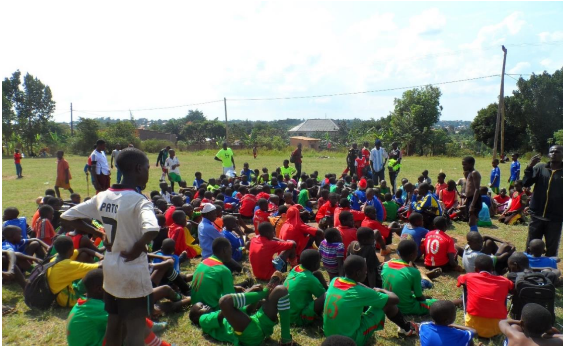
Teams participating in the tournament are briefed by the coach before games begin.