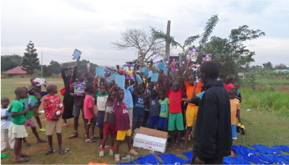
Excitement of receiving scholastic materials