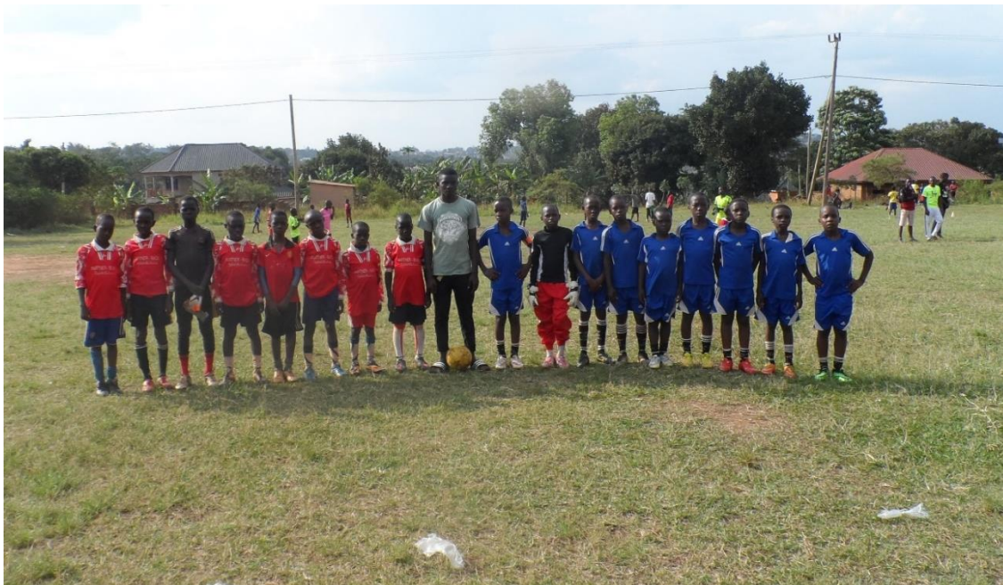
Buwate's under 12 team in blue, ready for a game with Vega Light Sports Academy