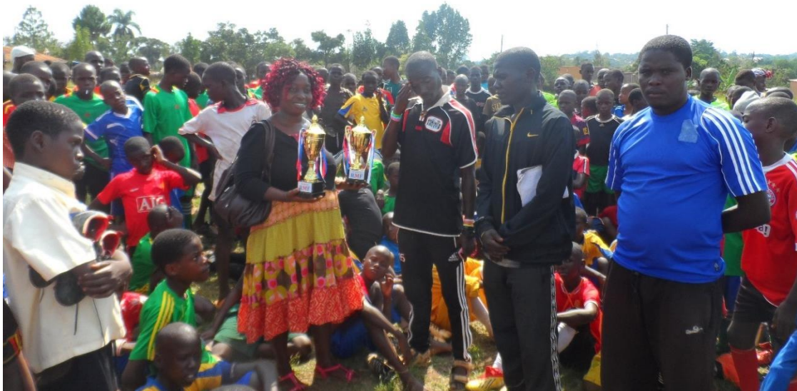
The coordinator presents trophies to the team managers.