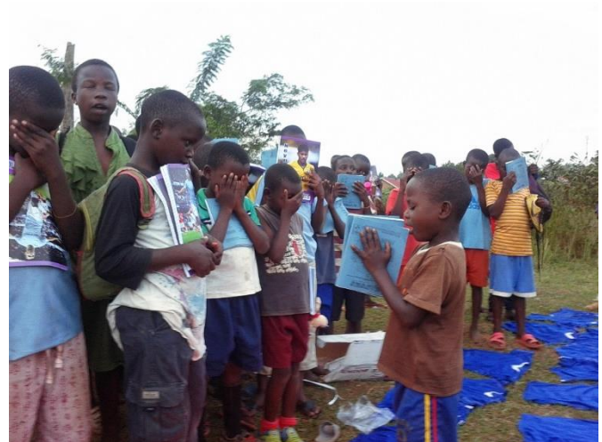
A prayer of thanksgiving for scholastic materials