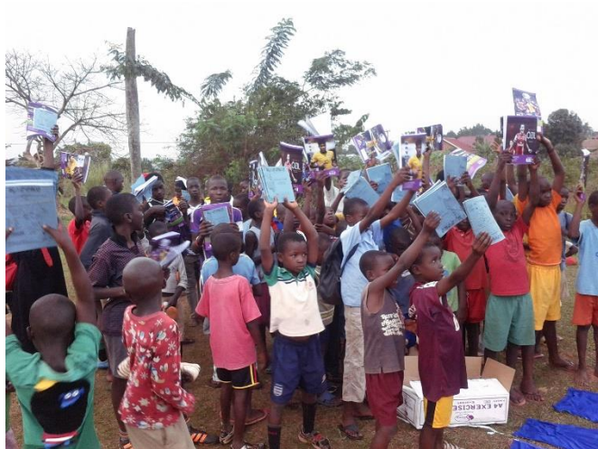
Children in Seeta receive books for the 3 rd term of 2016