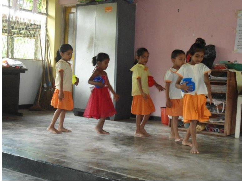
The children rehearsing for their performance