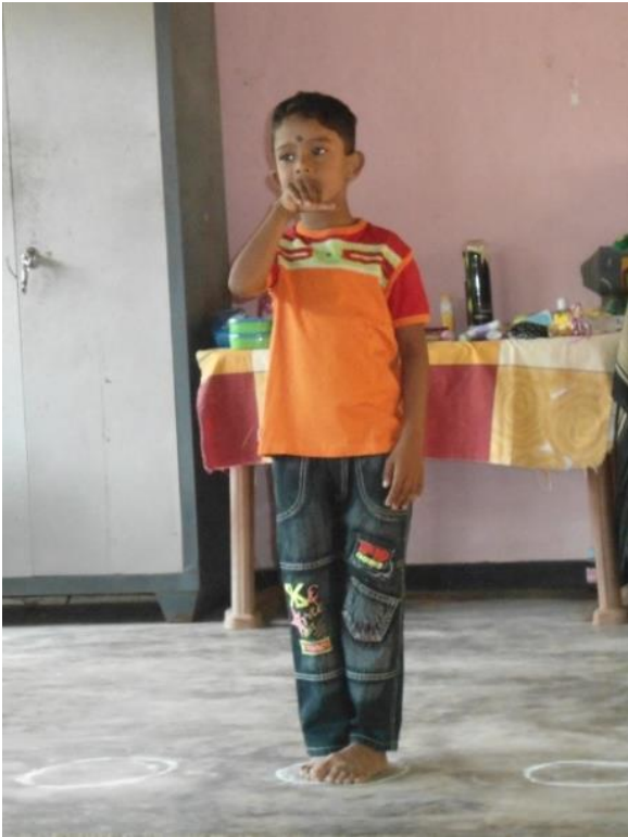
A closer look at the children's performance