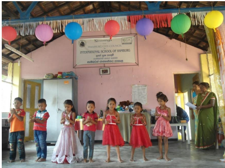
The school was decorated with colorful balloons for the concert.