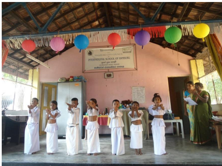
The teachers watch as the children perform.