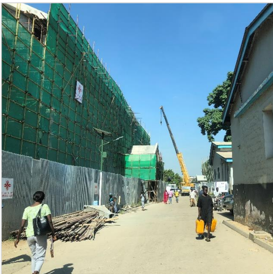
Side view of ongoing construction of the new Maternity ward