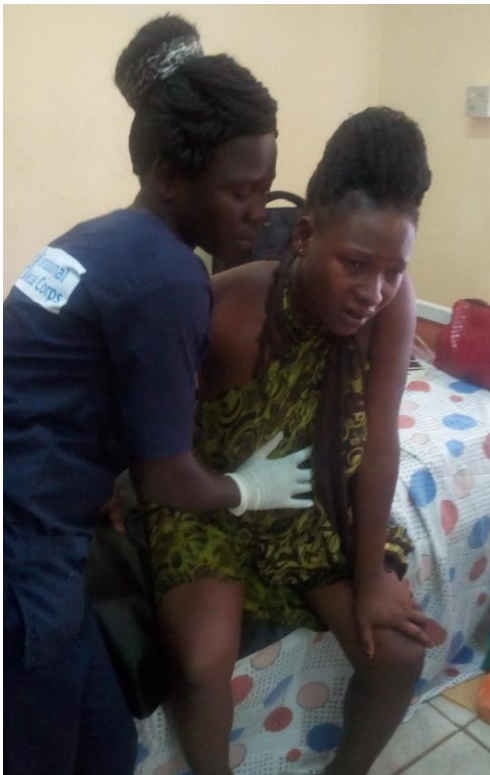
Implementing her RMF training, the JCONAM midwifery student is providing respectful care to the mother during labor pains