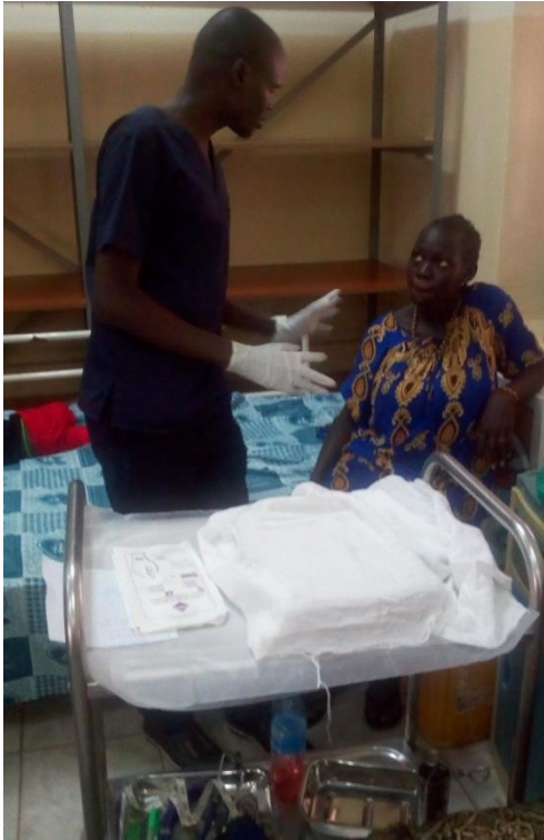
A JCONAM student at JTH explaining the process before examining a mother's baby