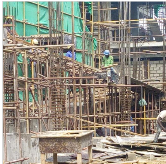
Another view of the Maternity ward under construction next to RMF South Sudan's main office at Juba Teaching Hospital