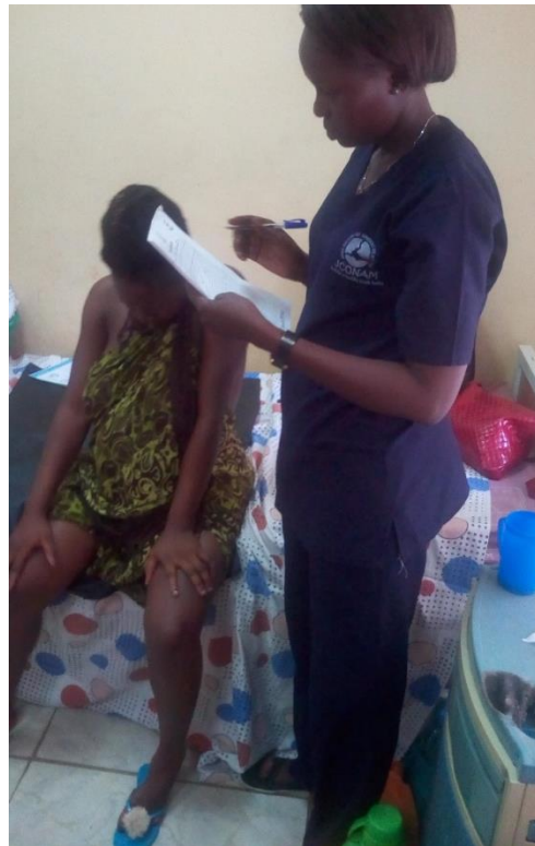
Another JCONAM midwifery student using a partograph to explain the results of her examination to the mother