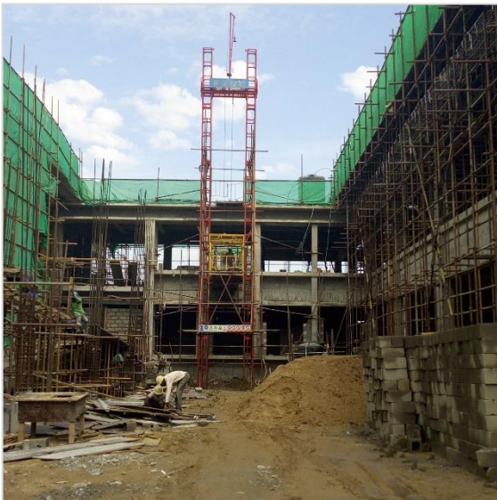
Internal view of the new Maternity ward under construction at Juba Teaching Hospital