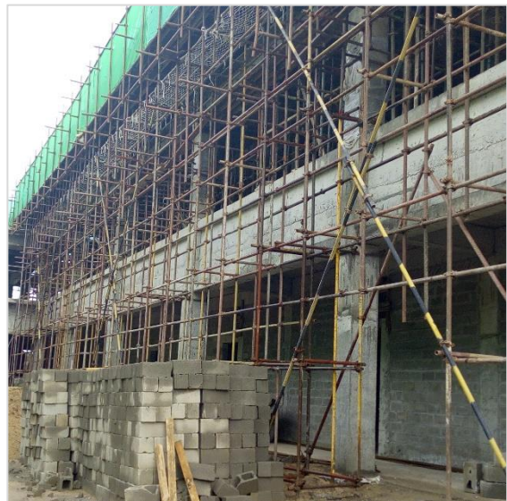
New OPD under construction at Juba Teaching Hospital