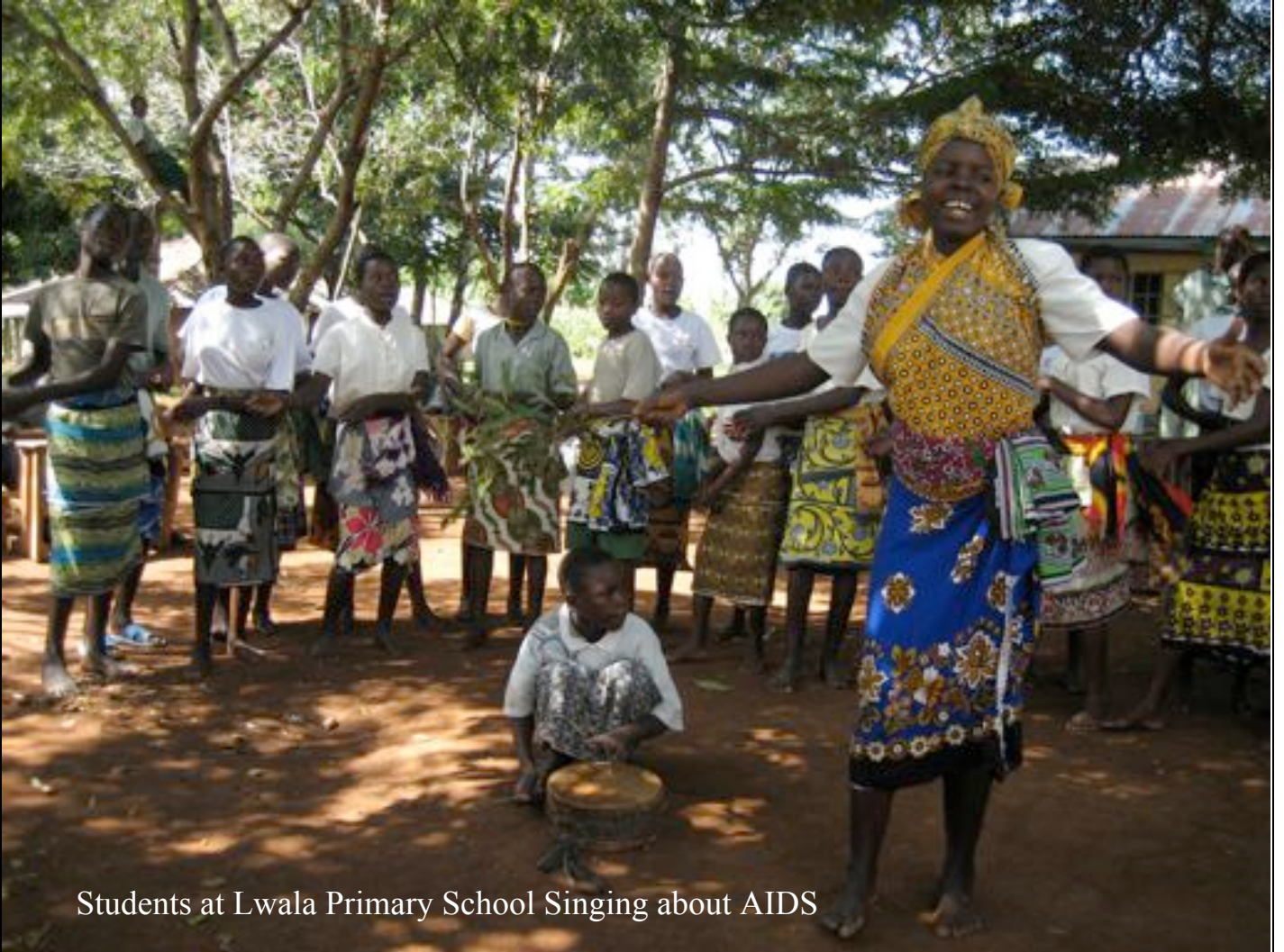
Students at Lwala Primary School Singing about AIDS