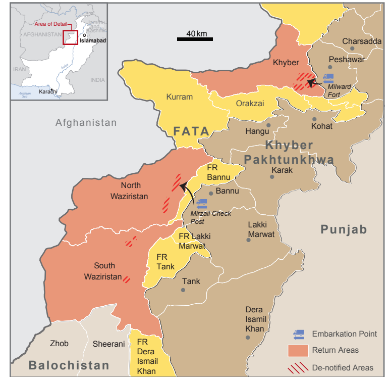
Progress of FATA returns in 2015