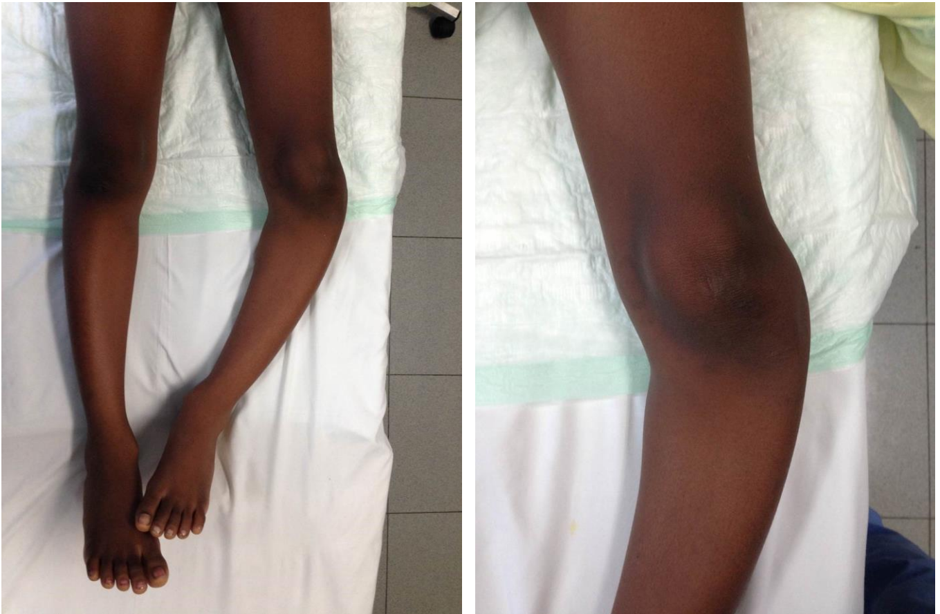
Samelle's severely bowed leg before surgery