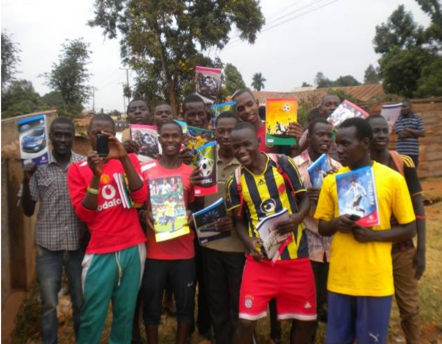
Boys from Kireka receive scholastic materials for first term