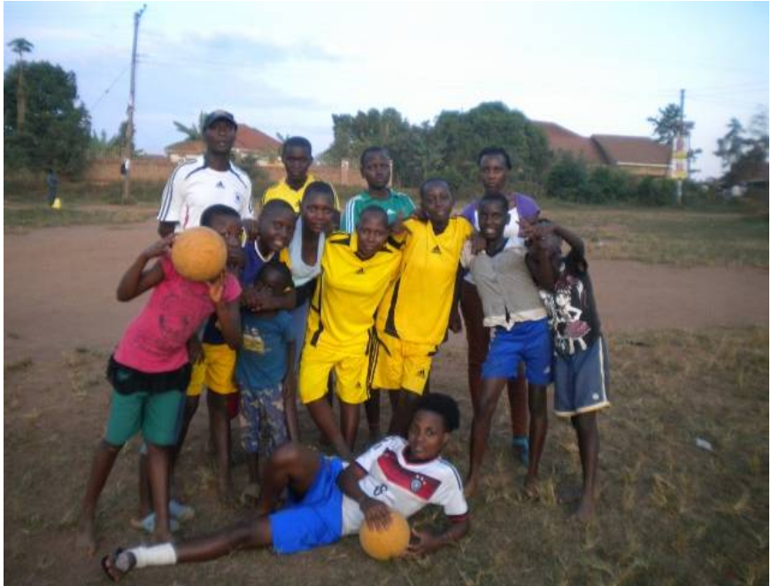
The coach and some academy children during the holiday program