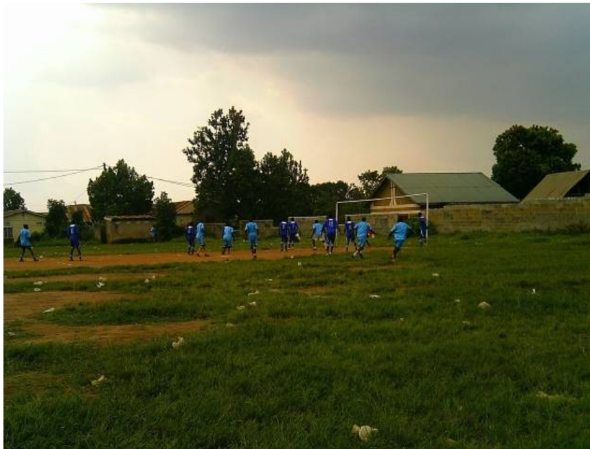
Buwate and Kireka boys in a friendly sports encounter at Buwate Sports Academy