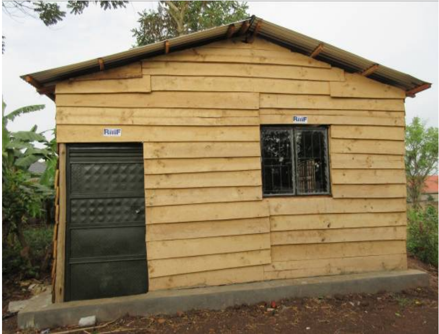
Semi-permanent structure used as a classroom for tailoring and hair dressing instruction