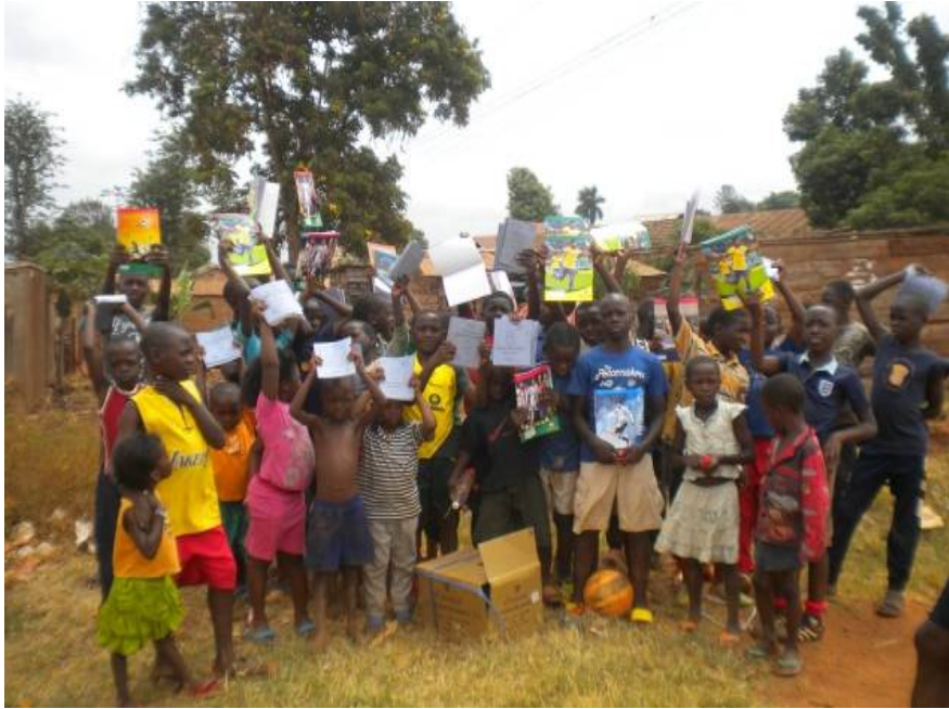
Kireka children receiving scholastic materials for first term, which starts February 2016