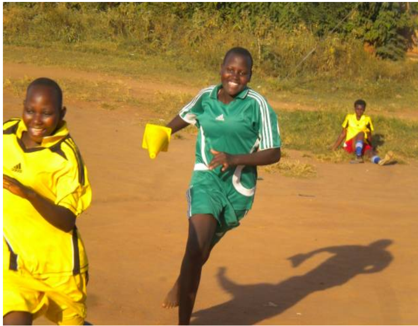
Girls in action during the “discrimination game” on International Women’s Day