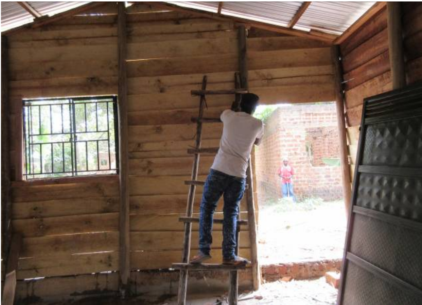
Construction of the semi-permanent structure tailoring and hair dressing classes