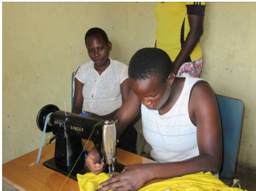
Learning tailoring skills at Buwate Sports Academy – trainees take turns since machines are few