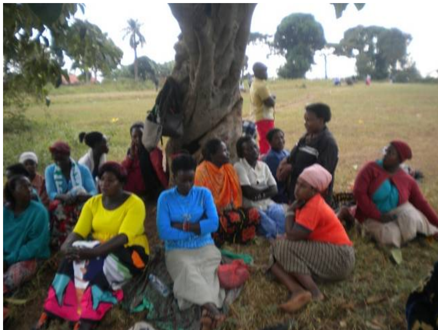
Women attended Buwate Sports Academy's dialogue on how to improve quality of life for women in Buwate. Hairdressing training was agreed upon as one of the steps that should be taken to empower women.