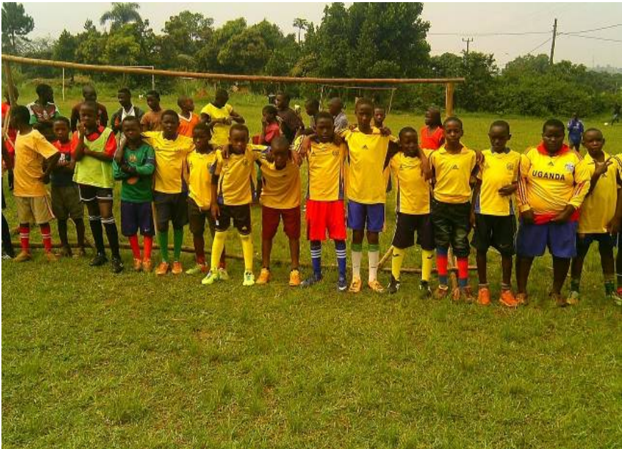
Children under 12 and 14 during the Seeta gala